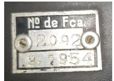
The red arrow indicates the location of the small manufacturing plate shown above.

After having received your photo(s), we will come back to you with all information we have found about the history of your Jungmann.